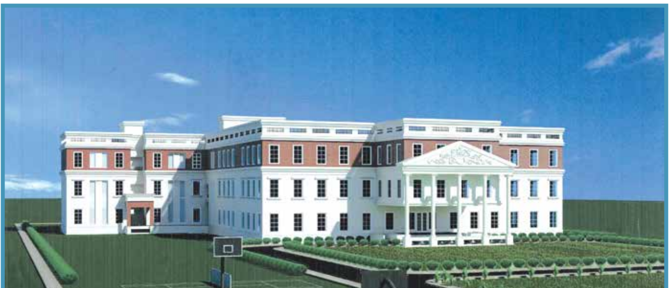
Chennai Campus in making