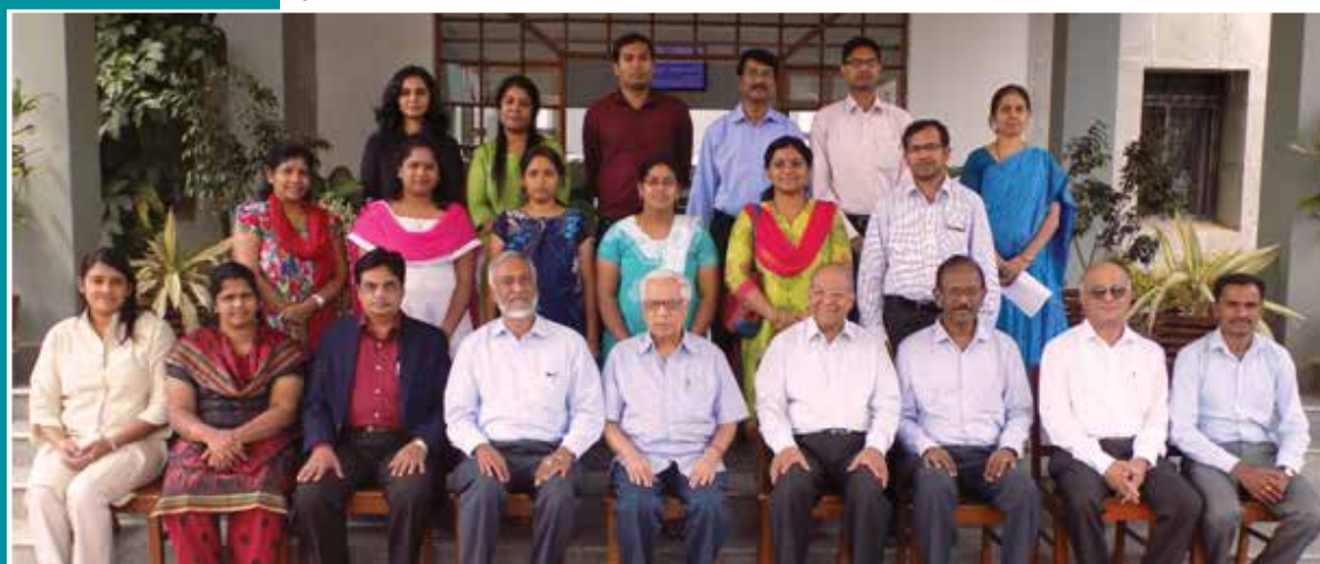
Participants of Case Writing Workshop