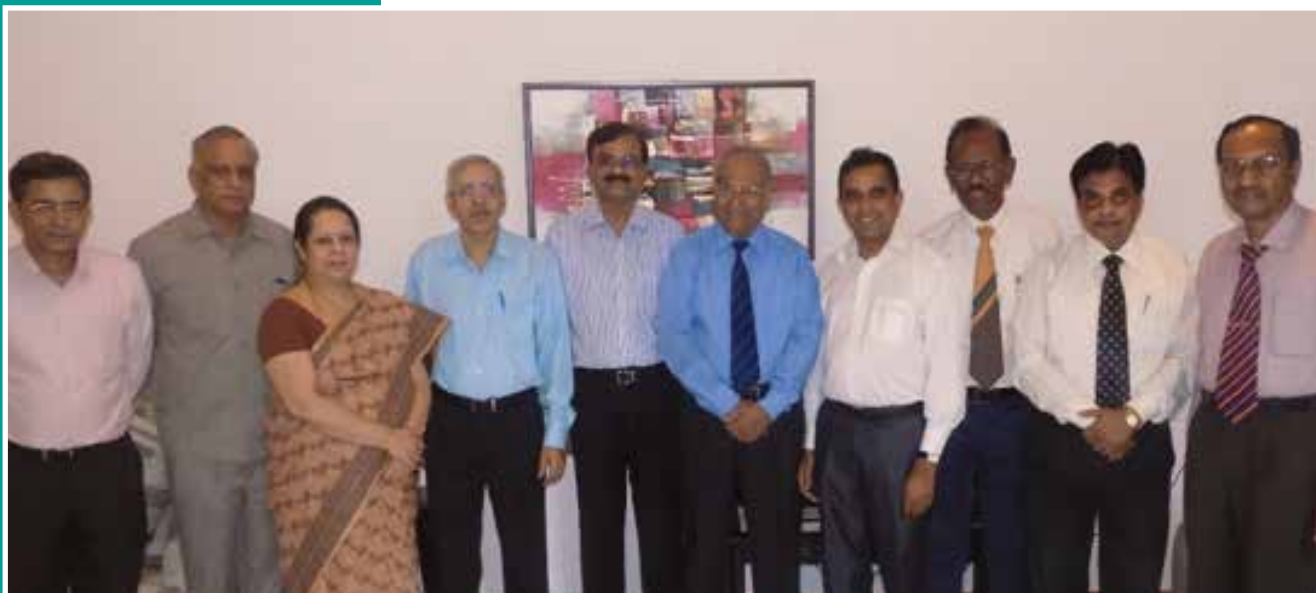
Members of KAABS Executive Committee at XIME Bangalore