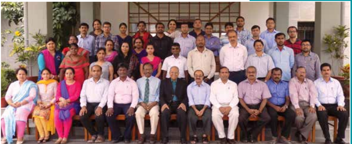
Participants of MDP on Econometrics and Research