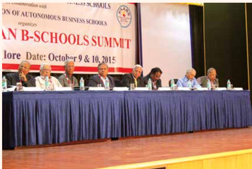
Inaugural ceremony of The First Indian B Schools Summit