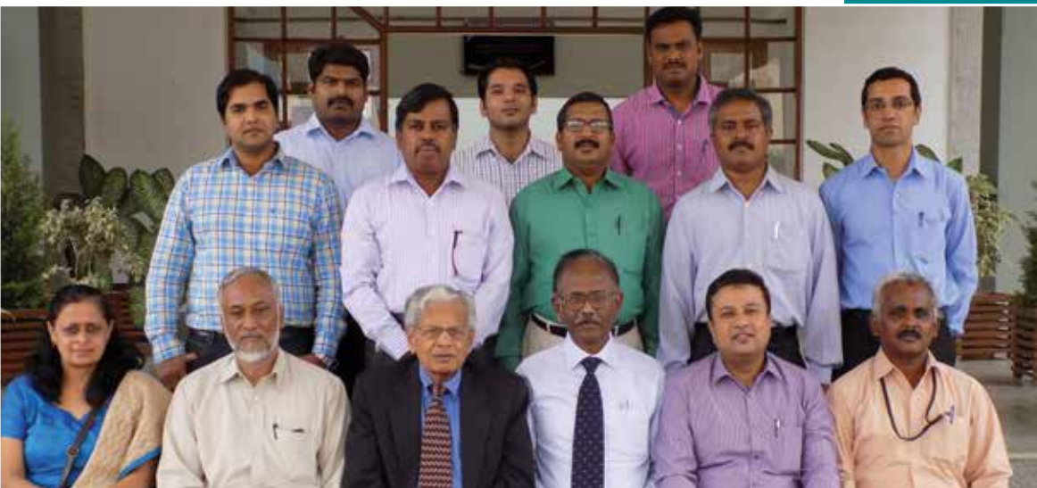
Participants of Knowledge Management Workshop