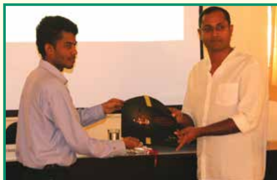
X-Ops Club inauguration