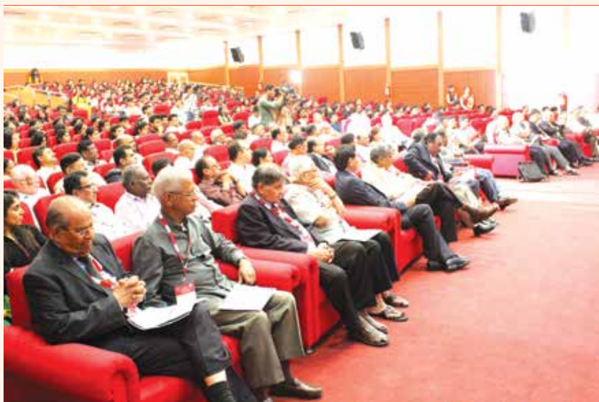
Delegates and participants of The First B Schools Summit