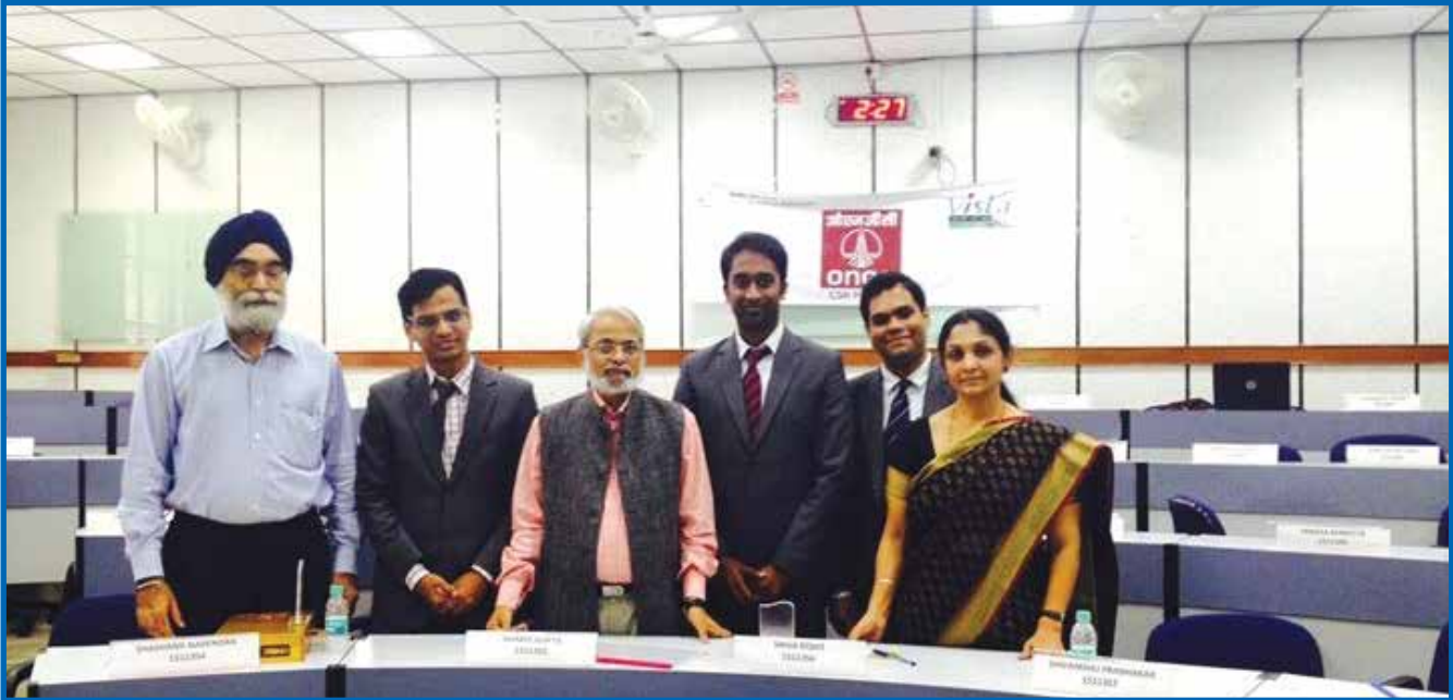
Winners of VISTA IIM B Fest