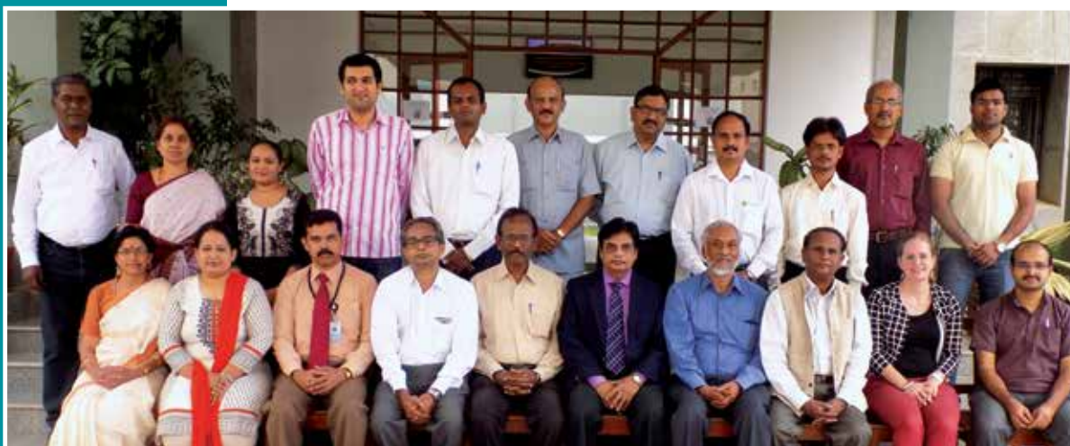
Participants of MDP on 'Leveraging Corporate Social Responsibility for Sustainable Growth'