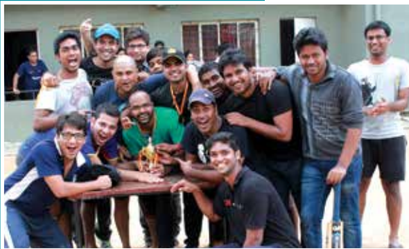
Table Tennis Competition (singles and doubles) was organized on 25 September, 2015.