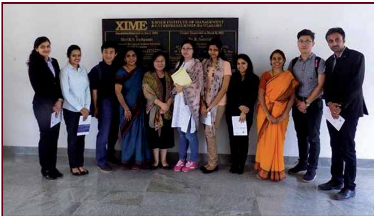
Shanghai Team Visit to XIME Bangalore