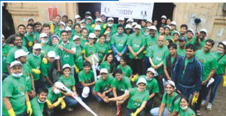
XIME students show the way for a cleaner country

X-seed, the social club of XIME organized a cleanliness campaign on 2 nd October, 2015 at Johnson Market, Bangalore. It was a commemoration to Mahatma Gandhi's words "Be the change you want to see in the world" . The Mahatma's visualization of cleanliness was three-pronged – a clean mind, a clean body and clean surroundings. Holding that, he emphatically wrote, "A clean body cannot reside in an unclean city" (Young India 19/11/1925).