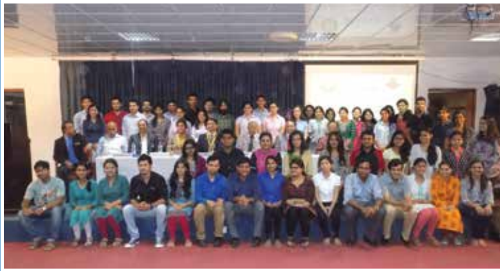
The Rotarians of XIME, Bangalore