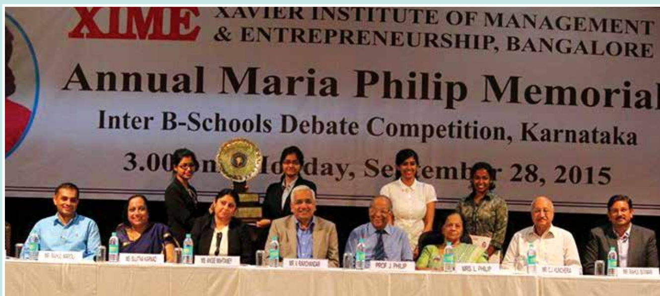
The IIM-B Winners Team of the Maria Philip Debate with the rolling trophy