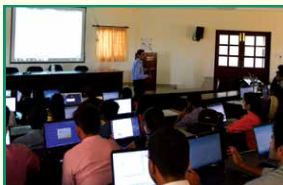
Students at XIME Kochi attending the 2 day training programme on Excel