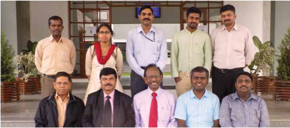
Participants of MDP on 'De-mystifying A-Z of Letters of Credit & UCP 600'